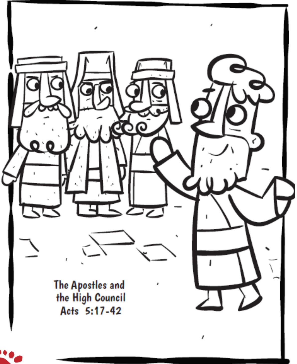
The Apostles and the High Council Acts 5:17-42