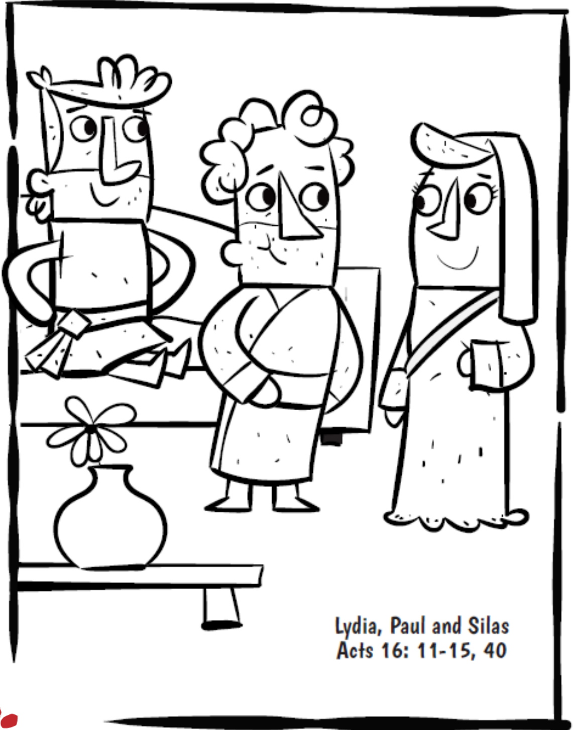
Lydia, Paul and Silas Acts 16: 11-15, 40